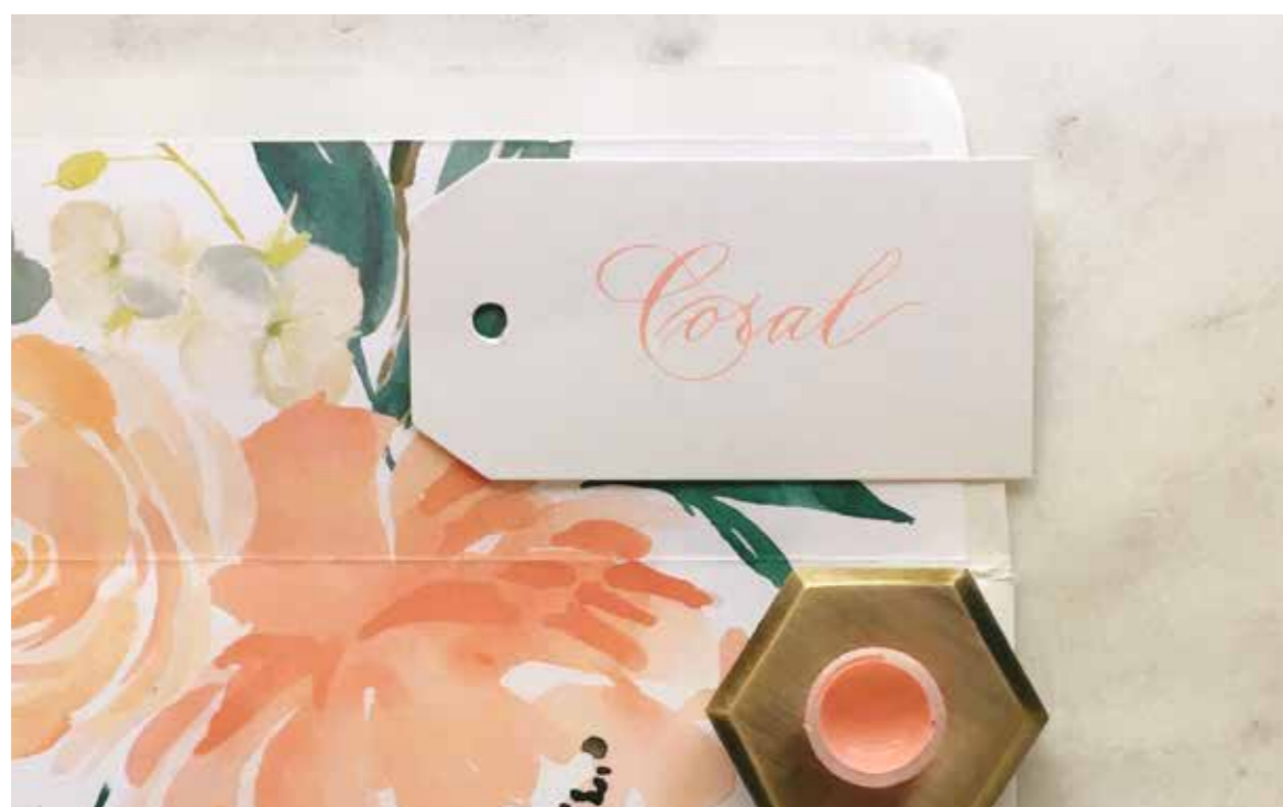
Right: Joi's calligraphy is influenced by traditional styles

"Hearing the scratch of a nib on paper is mesmerising."